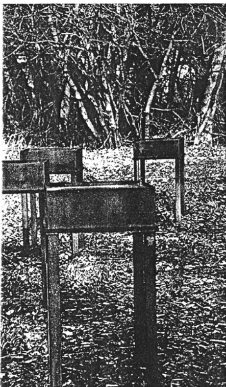
O'Callaghan: Scenic View , 2001.

Anne O'Callaghan: Scenic View Visual Arts Centre of Clarington, Bowmanville, Ontario September 2001–June 2002