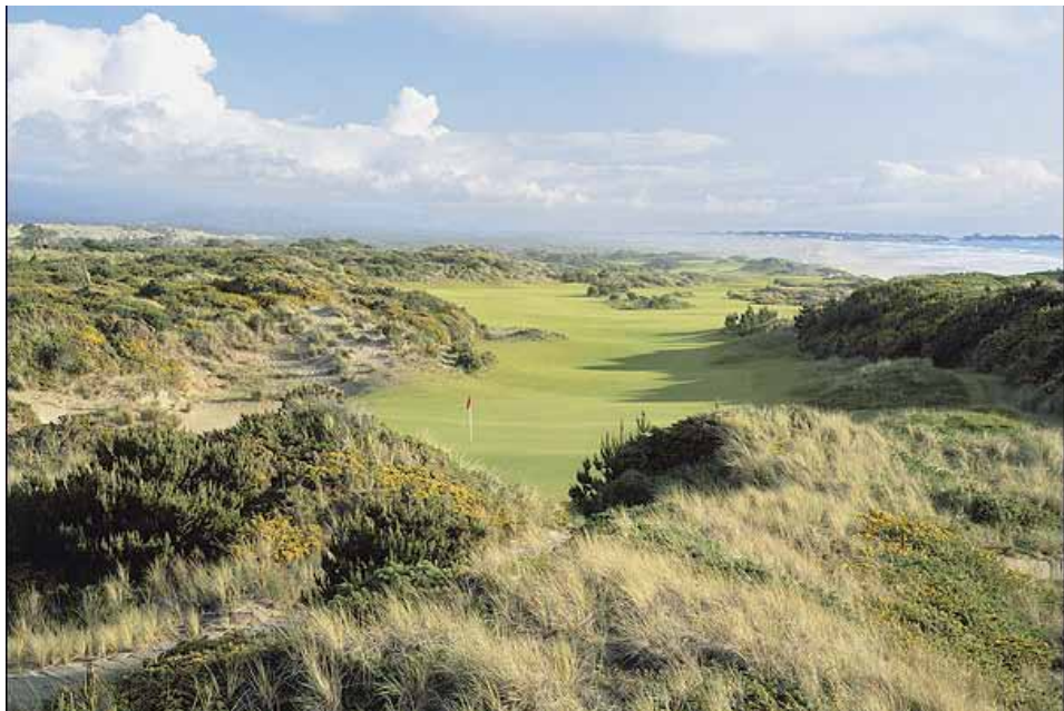
Golfing In The Desert