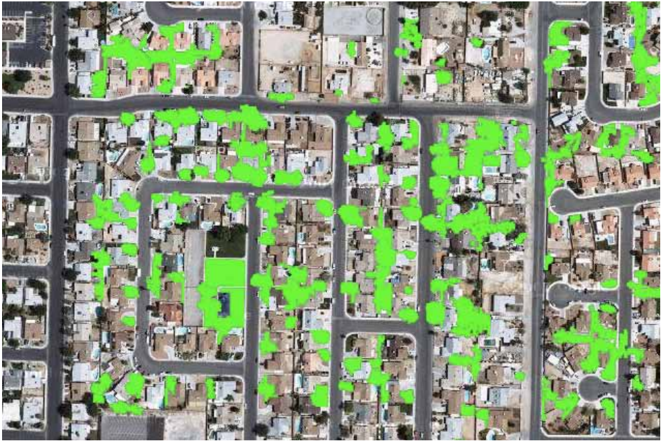
Greening The Desert